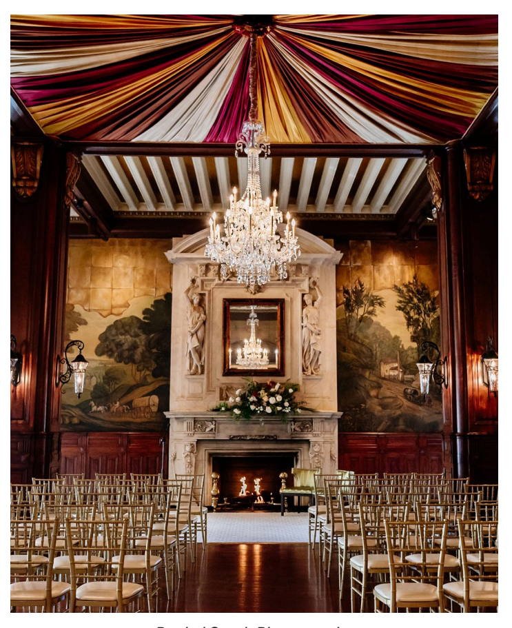
Rachel Smith Photography