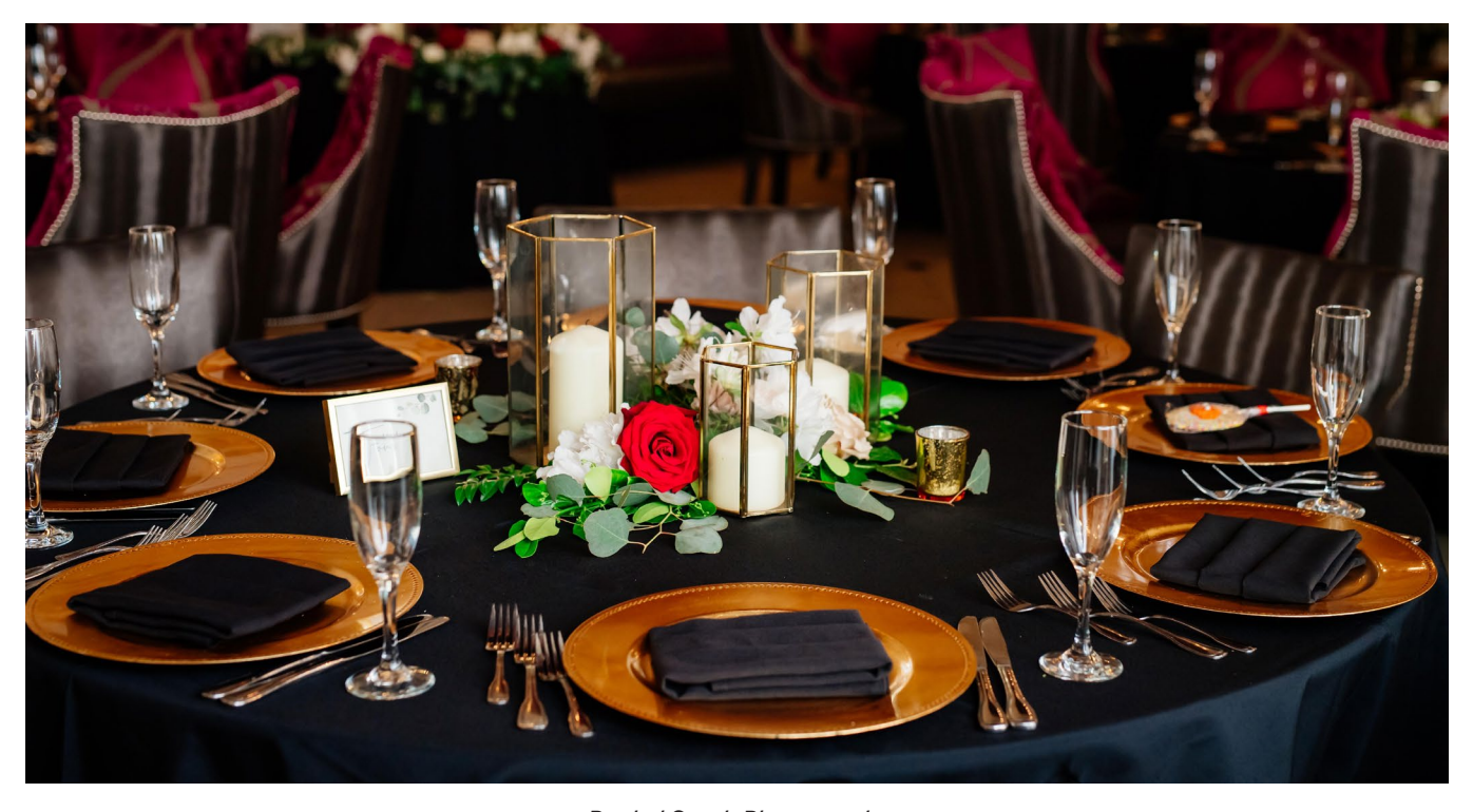
Rachel Smith Photography